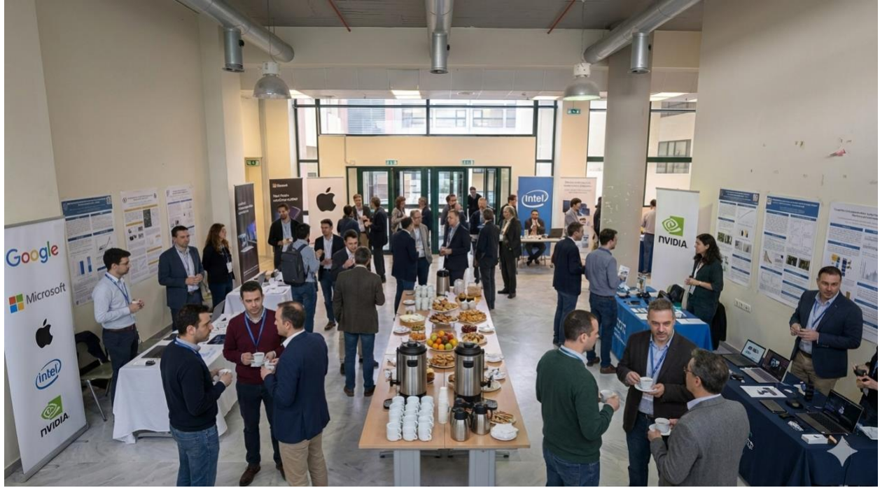
Indicative promotional banner placement in conference exhibition space