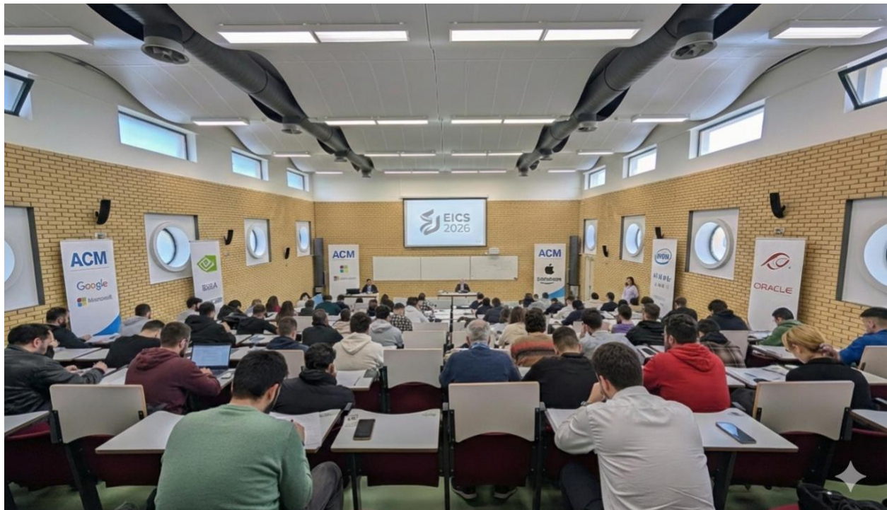
Indicative promotional banner placement in conference main room